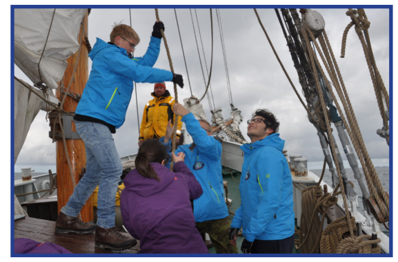
..The basic concept was to sensitize young people for climate issues."