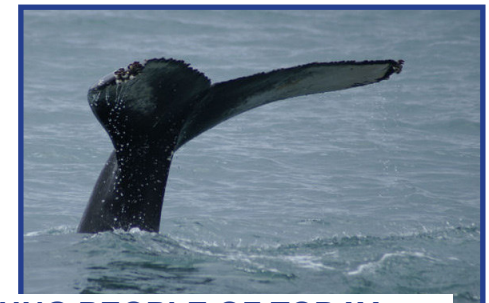
"THE YOUNG PEOPLE OF TODAY ARE THE DECISION-MAKERS OF TOMORROW"